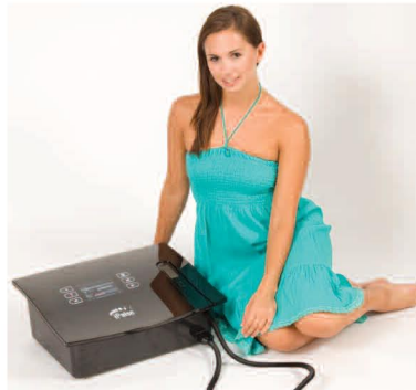
The i400 is available in two versions—table-top and standalone with integral cart.

The i400 plugs into a standard wall outlet and is ready to use immediately. Lamp cartridges provide the optimum light energy for treatment throughout their fixed lifetime; they are just as powerful on their 10,000 th shot as their first. The computer alerts the operator when the lamp needs to be replaced...a ten second task for the operator just like changing a normal light bulb.